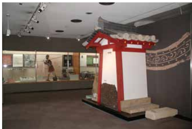
Photo 2-5-2 The Muko city cultural reference center permanent exhibition

A three-institution complex facilities of the library, the cultural reference center, and the Kyoto prefectural archaeological research center