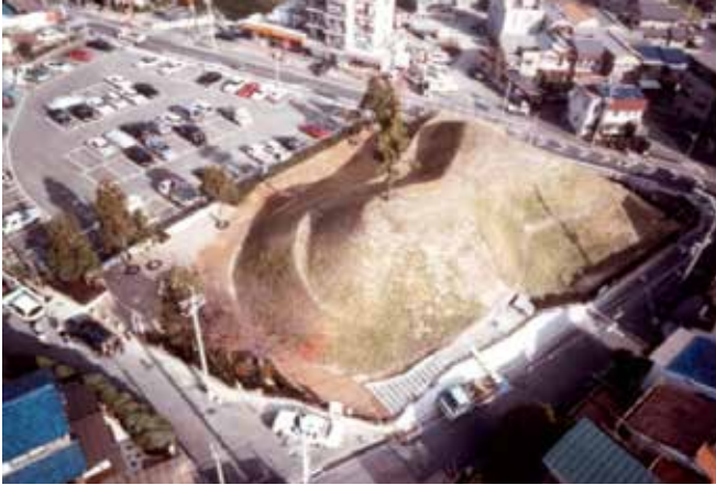
Photo 3-1-6 The Mozume Kurumazuka Tumulus whole view

After the Mozume Kurumazuka Tumulus, no large kofun such as a zenpokenfun (a large keyhole-shaped Tumulus) was built in this municipal area. Instead, clustered Tumuli were built at the foot of the hills, and with the arrival of Buddhism, powerful local ruling families started to build Buddhist temples.