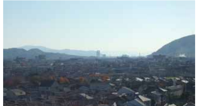
Photo 3-1-10 View from the Muko Shrine