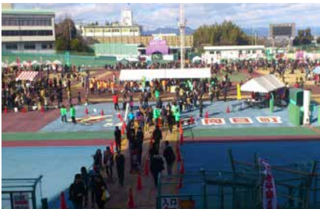
Photo 2-6-4 KARA-1 Grand Prix