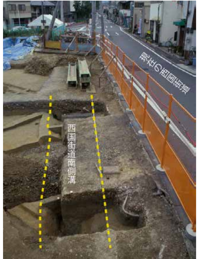
Photo 3-1-14 The Saigoku Kaido Road detected in front of JR Muko-machi station

While development was actively conducted, excavational investigation of Nagaoka-kyo was conducted in the area 30 meters north of Hankyu Nishi Muko Station at the end of December, 1954, and the remains of something equivalent to Heian Kaisho Mon were found on New Year's day of the following year. Since then, excavational investigations have been conducted in proportion to development, and more than 2,000 investigations have been conducted to date.