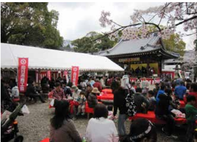
Photo 2-6-1 Cherry Blossom Festival at Muko Shrine

The festivals and events in our city include various festivals at Muko Shrine such as “Shinko Festival” and “Kanko Festival”, “Cherry Blossom Festival”, “Daigokuden Festival” to commemorate the establishment of Nagaoka-kyo, “Muko city Festival” and “Take no Michi/Kaguya no Yube”.