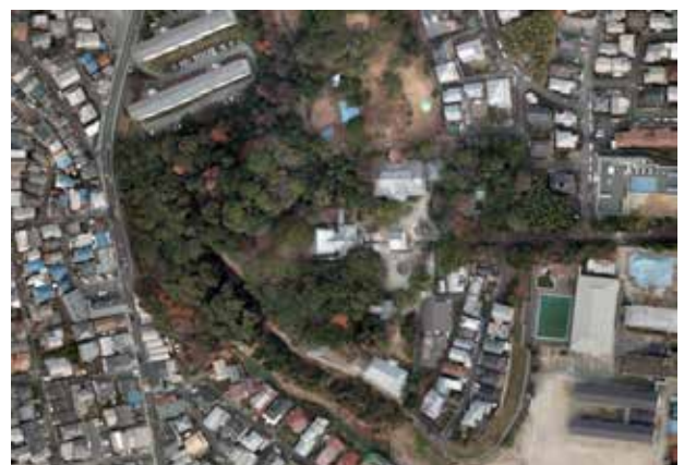
Photo 3-1-8 Located in the narrow part of the southern edge of Mukokyuryo the Muko Shrine (On the north side of the Muko Shrine is the Moto Inari Tumulus)

In the Nara period, the Muko Shrine, one of the most famous old shrines in the Otokuni district, was constructed.