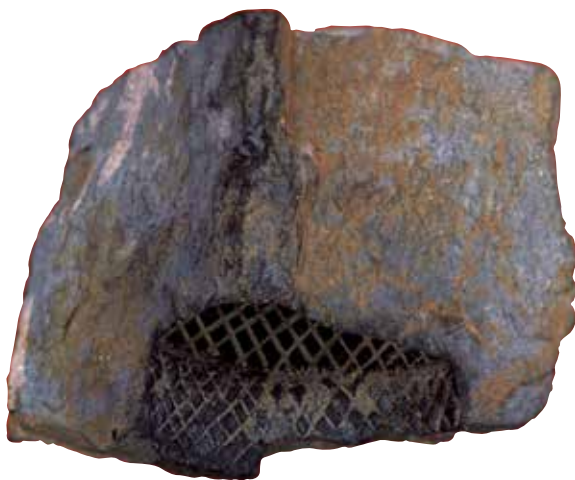
Photo 3-1-5 Excavated at the Kaide ruins the copper mold

The development of agricultural production, which centered on rice paddy cultivation that produced many settlements during the Yayoi period, created chiefs who lead their areas with the background of its increased productivity and the convenience of water and land transportation, etc., and ancient tombs were built to bury chiefs.