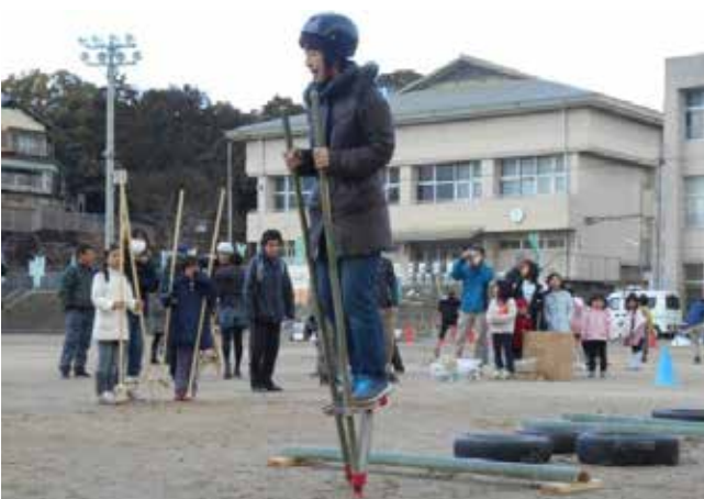
Photo 2-6-6 The national stilts competition