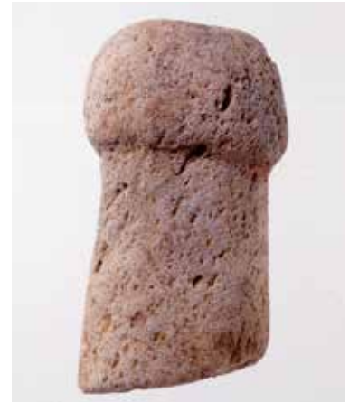
Photo 3-1-2 Middle-Jomon-period stone bars at the Nanzan ruins