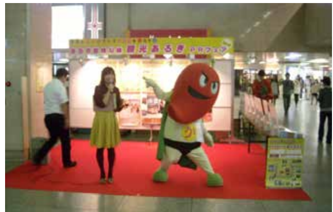
Photo 2-6-5 The mascot character "Karakki" in Kyoto Muko city Ultra Spicy Shopping Street