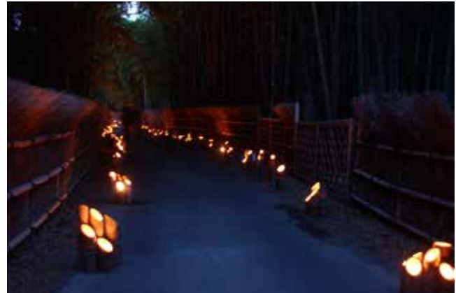
Photo 2-6-3 Take no Michi/Kaguya no Yube

The national stilts competition (since 2003) which was inspired from our "bamboo" resource and the information center in Chodoin Park which was built at the historic site of Nagaoka Palace site (since 2010).