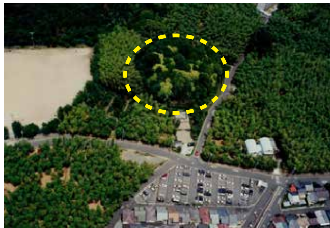
Photo 3-1-11 The Tumulus of Empress consort of Emperor Kanmu of Mukokyuryo

As for remains in the city area, the ruins of Mozume Castle, the residence of the Mozume clan, are located at the top of the terrace of Mozume-cho. These castle ruins show a rectangular tankaku style. In these castle ruins, part of the moat and the earthen walls still remains. In the recent