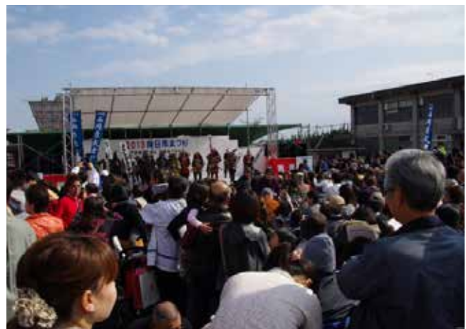
Photo 2-6-2 Muko city Festival