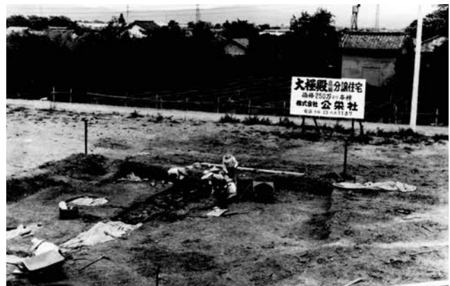
Photo 3-1-15 Excavational investigation of Nagaoka-kyo as development progresses (in 1961)