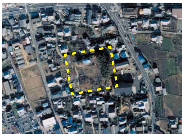
Photo 3-1-12 Aerial photograph of the ruins of Mozume Castle