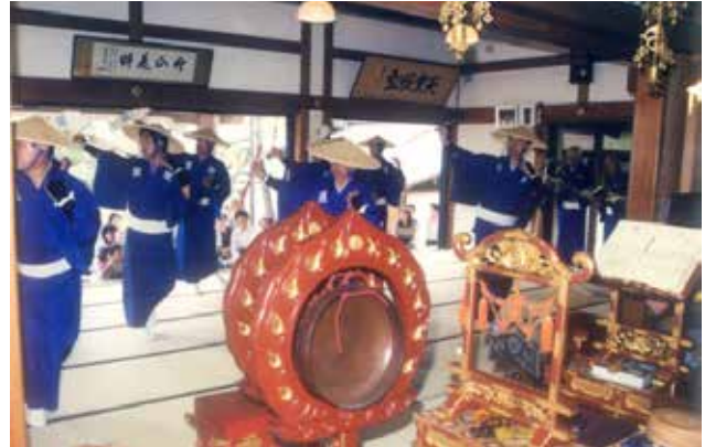
Photo 3-1-13 Kaide Daimoku Odori (The Cultural Properties of Kyoto Prefecture Designation)

Sekito-ji was founded in 1469-88 in relation to the stone pagoda that Nichizo built. After going through rises and falls, Sekito-ji took over the principal image of Buddha and other materials of Koryu-ji which used to be located to the west of Daigokuden but was abolished in the early Meiji period. Thus, Sekito-ji has continued into the present day. On May third of every year, "Kaide Daimoku Odori," an event related to Nichizo and passed down from the Kamakura period, is dedicated to the temple. Kaide Daimoku Odori is a unique folk entertainment that remains in only three places throughout the country: this place, Matsugasaki, and Shugakuin, of which the latter two are in the northern part of Kyoto city, Rakuhoku.