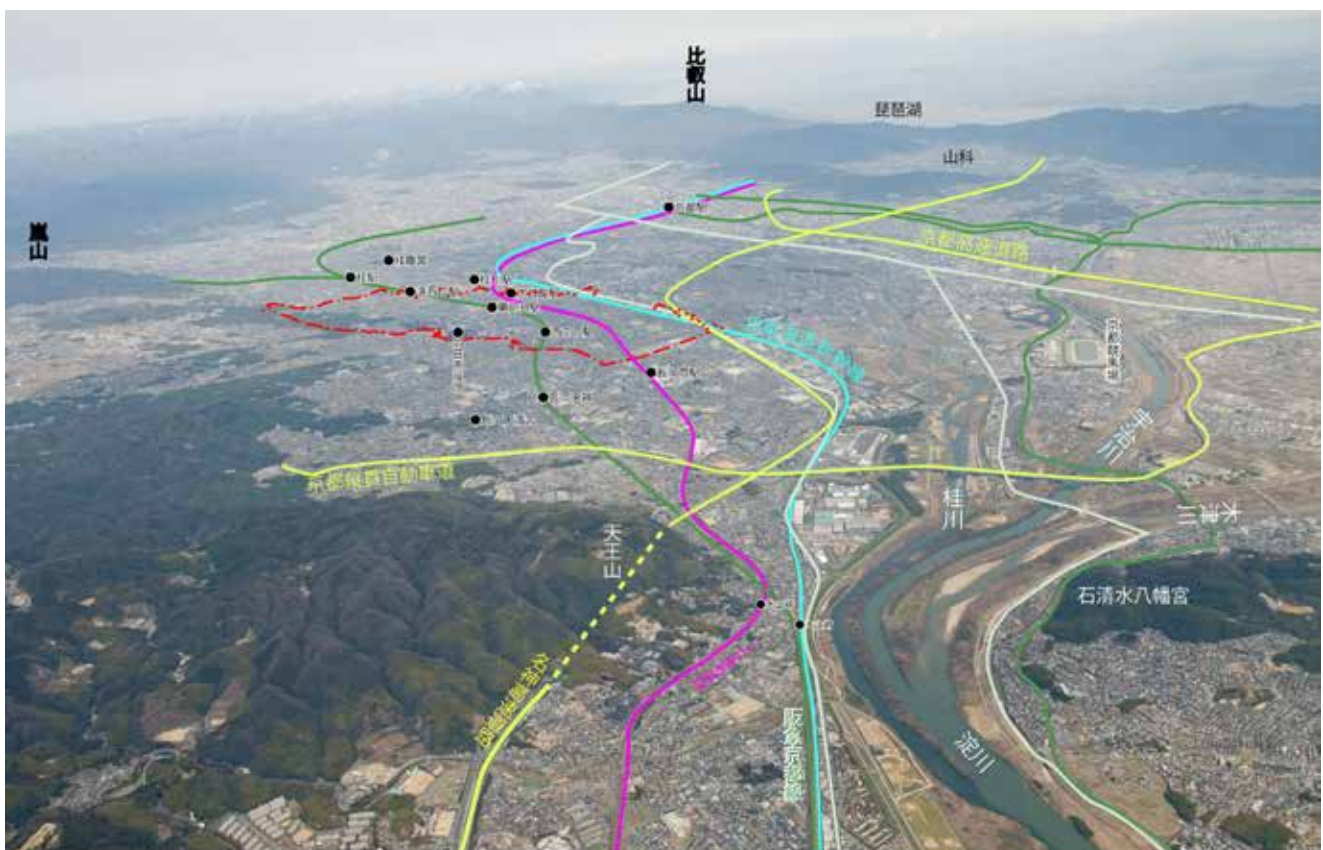
Photo 1-1-1 Aerial photograph of Muko city (View Kyoto city direction (northeast) from the point where the Kizu River, Uji River, Katsura River join)