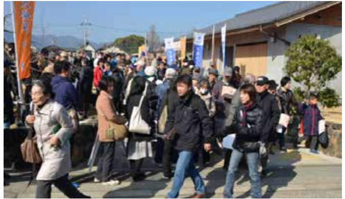
Photo3-1-16 Stamp Rally at a historic site

In the Heisei era, regional development and tourism is being promoted by connecting historical heritages such as the Muko Shrine, kofun (or ancient Tumuli), historic buildings, etc. as well as research and study of the Nagaoka-kyo ruins and enlightenment activities such as exhibitions and lectures.