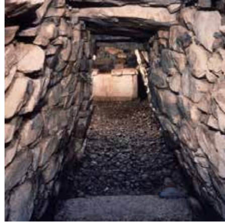
Photo 3-1-7 The Mozume Kurumazuka Tumulus the horizontal stone chamber

Around that time, irrigation canals for which water was taken from the Katsura River were built so that it goes through the municipal area from the south to the north. The Toji Hyakugo Monjo (a national treasure) has canal pictures and maintenance records. It is one of the famous canals in the history of the studies of Japanese irrigation history, and it still supplies water to the paddy fields in the surrounding area.