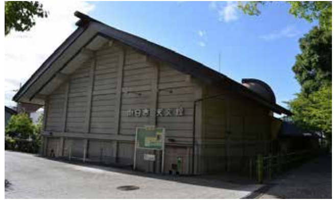
Photo 2-5-4 The Muko city planetarium