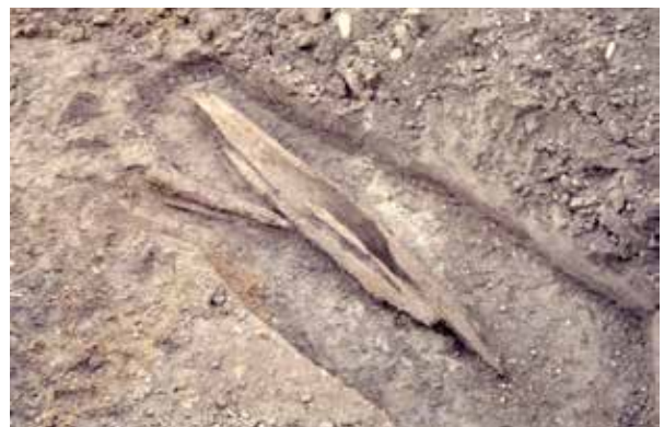
Photo 3-1-3 The Jomon period dugout boats which was excavated in the Higashi Tsuchikawa Nishi ruins