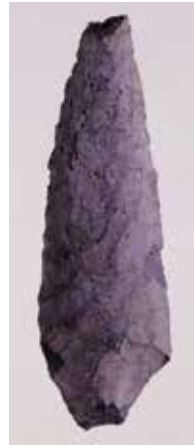
Photo 3-1-1 Excavated at the Dencho ruins Yuzetsu Sentoki

In the middle period, irrigation canals were put into use at the Morimoto ruins, utilizing the terrain under