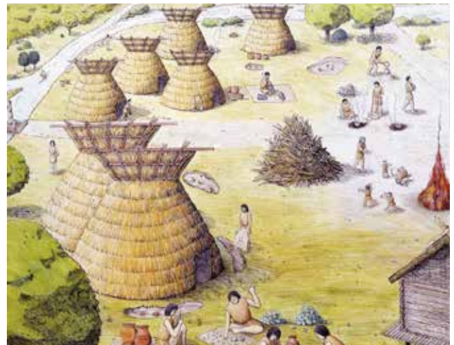
Figure 3-1-1 Restore diagram of Kaide ruins