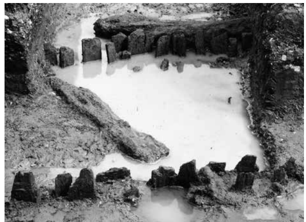
Photo 3-1-4 Morimoto ruins waterway